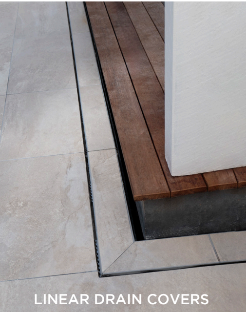
LINEAR DRAIN COVERS