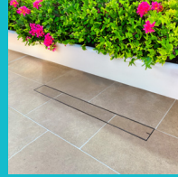
LINEAR DRAIN COVERS